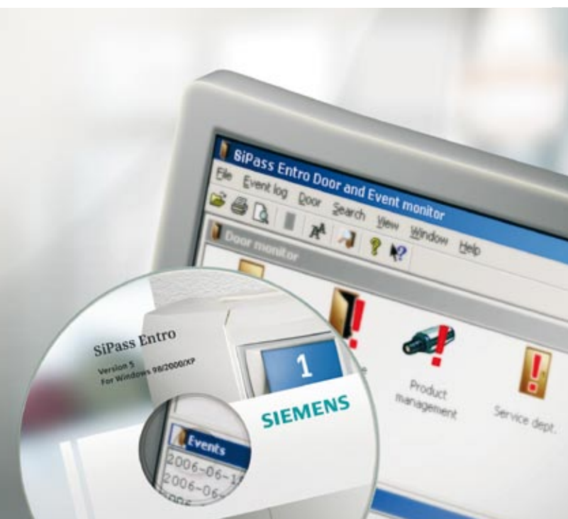
SiPass® Entro software